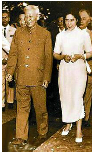
Fig. 1: Liu Shaoqi and His Wife Wang Guangmei in 1966