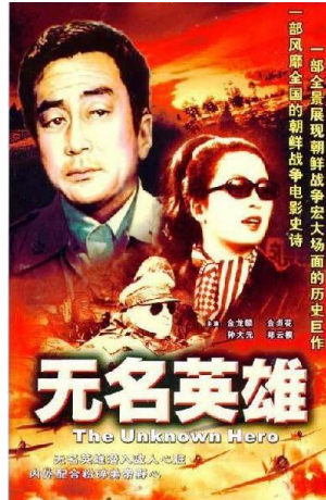
Fig. 3: Chinese Poster for the Film “The Unknown Heroes”